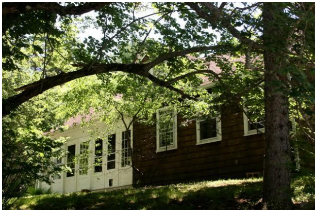
Rear (north) elevation