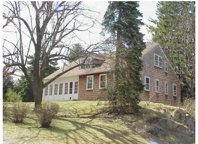
Assessors' photograph: Rear and left side elevations