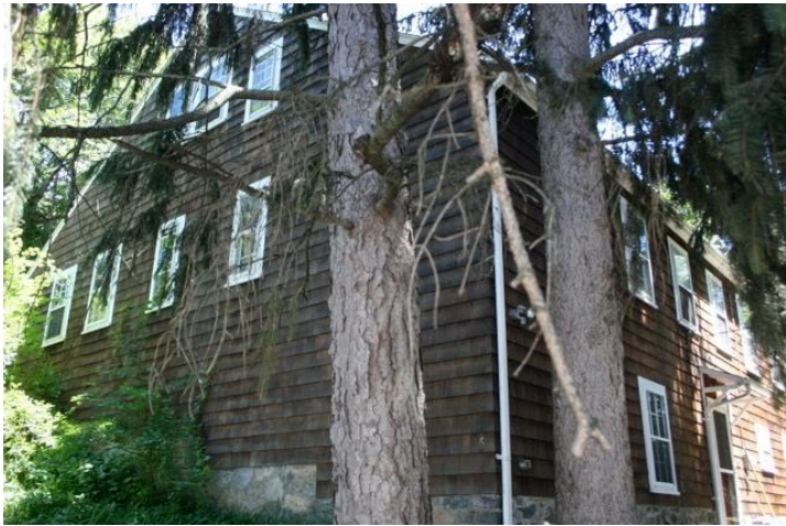
West and south elevations