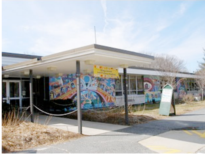
Detail, front entrance with mural