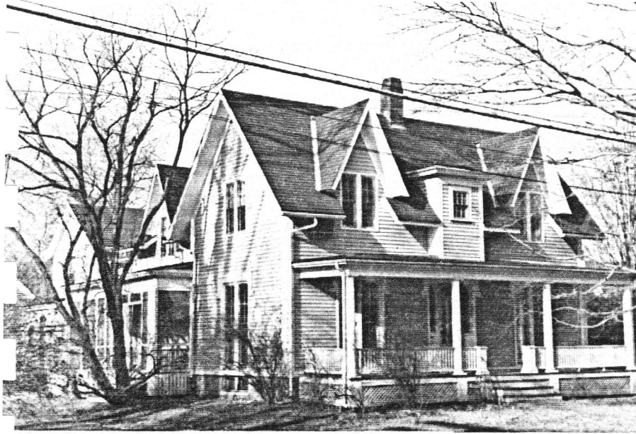
91 • NYF •