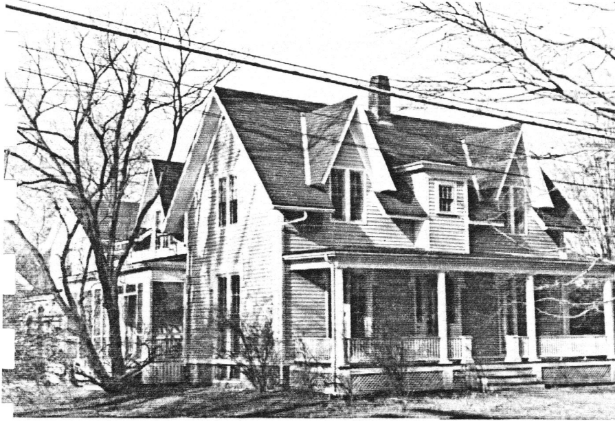
9L • NYF •