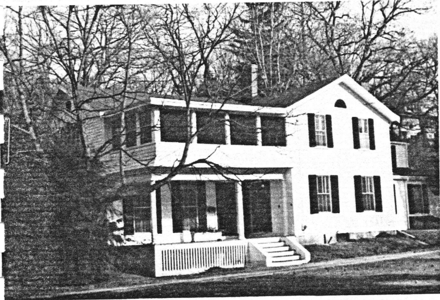
92 • NYF