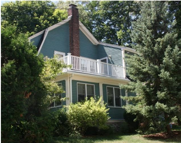
Right side elevation