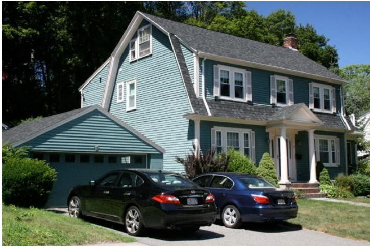
Left side and front (façade) elevations